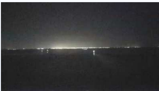
Human eye view