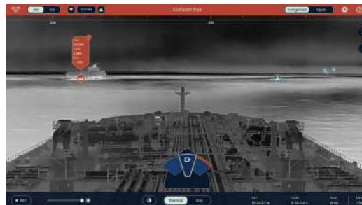
Orca AI view