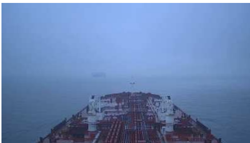
Human eye view